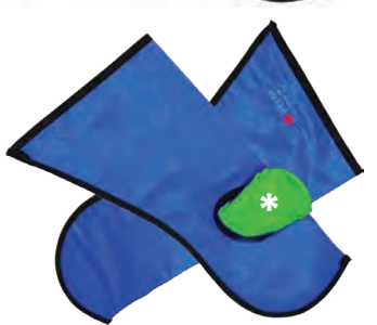
* Different colours shown are for deliniation purposes only.